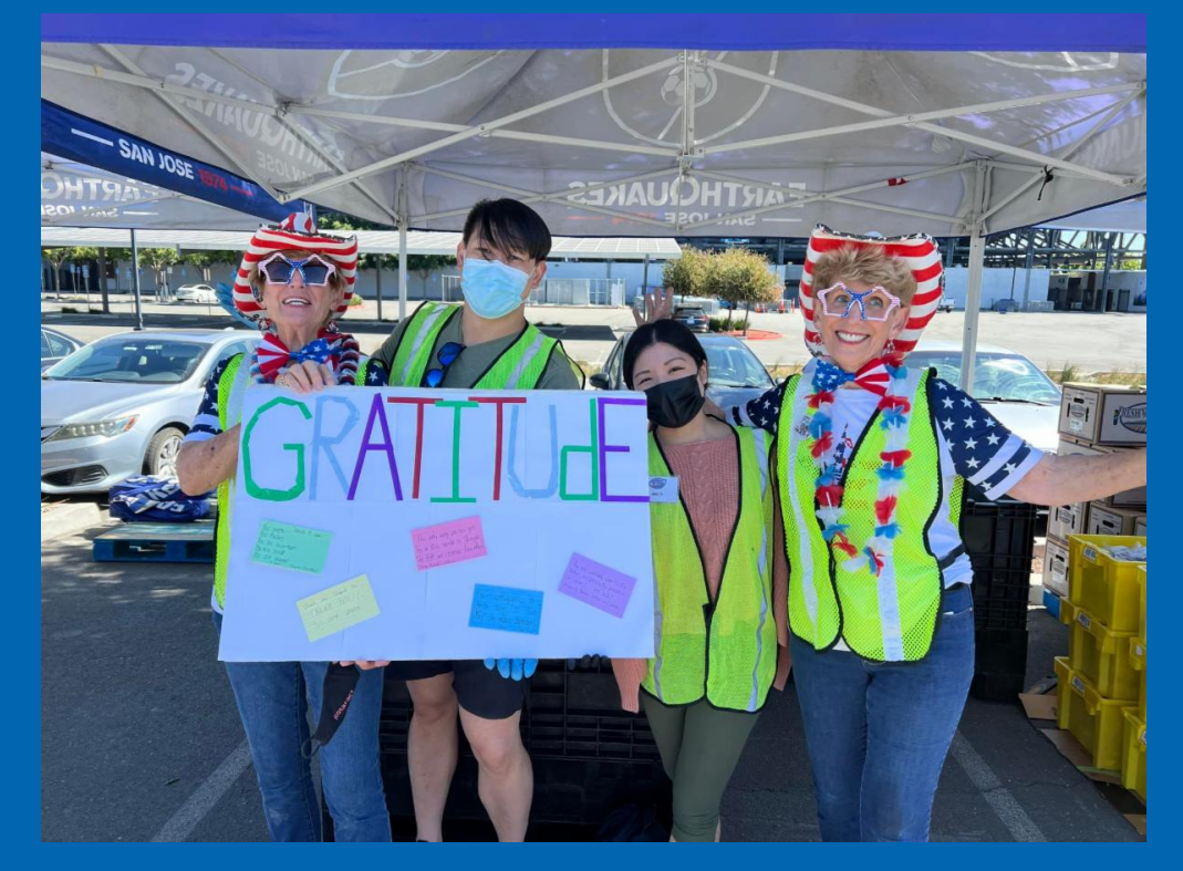
Volunteers pass out prepared meals, groceries and pantry goods at our weekly food distribution at Pay Pal Park. Making friends and spreading cheer is part of the fun!