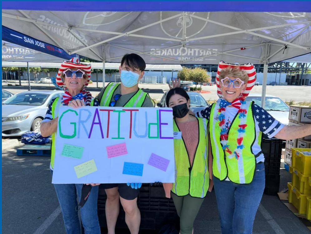
Volunteers pass out prepared meals, groceries and pantry goods at our weekly food distribution at Pay Pal Park. Making friends and spreading cheer is part of the fun!

Tickets on Sale Now for 2022 Bridge the Gap Gala